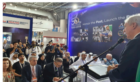
Media Events and Placements